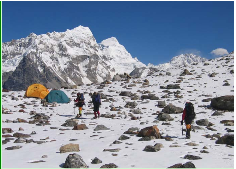
The mushroom- shaped mountain situated in the Langtang region of Nepal which offers a spectacular view of the summit.